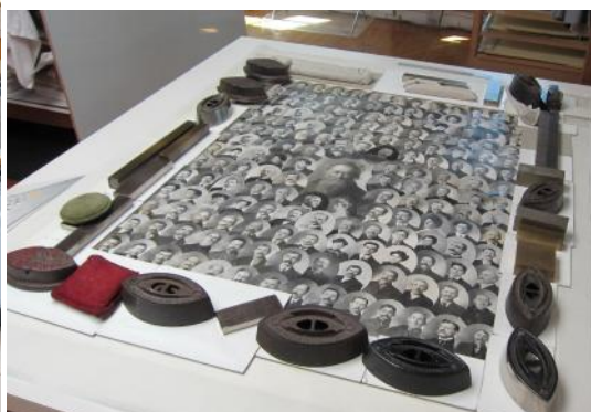
Two of the in-progress images