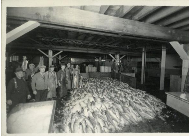
Workers in storage room of the Juneau Cold Storage, c.1930-1940, JDCM 2013.14.137

The Juneau Cold Storage album has a beautiful leather cover and contains 116 photographs. The photographs document the life of the Cold Storage building from its