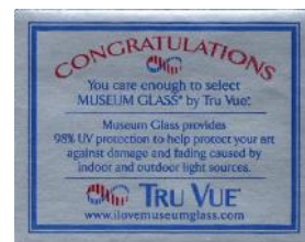
Label from new glass put in the frames for both murals.